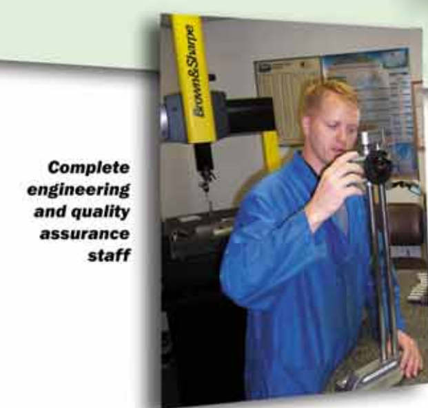
Complete engineering and quality assurance staff