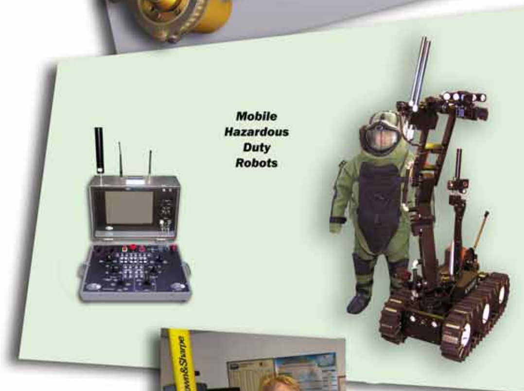
Mobile Hazardous Duty Robots