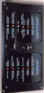
Custom annunciator panel