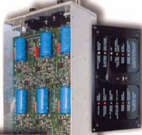
Liquid cooled shipboard power supply